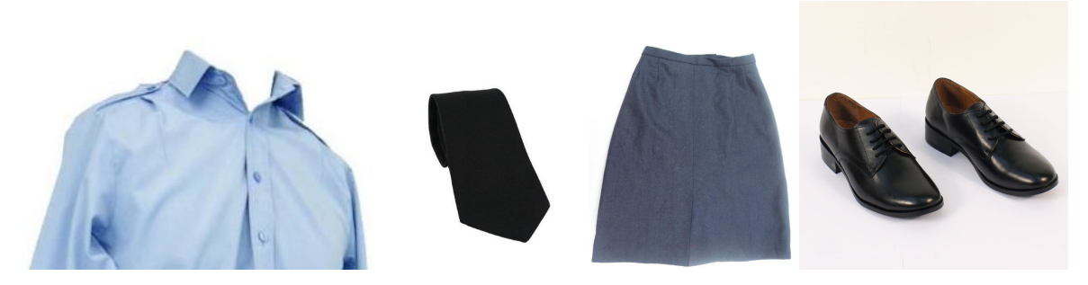
Shirt - A blue/grey colour button up blouse with no pockets. Men's can be worn with the pockets removed, Link \underline{1} , \underline{2} , \underline{3}

These items are the basis of the WAAF costume. We've managed to find all of these items quite cheaply online and estimate a complete basic costume should cost no more than about £55 even if you need to buy everything.